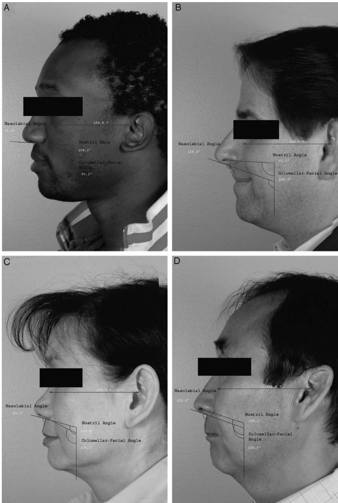
Fig. 3. (A) Upper lip slopes posteriorly toward the nose. Poor consistency between nasolabial angle (NLA) and columellar-facial angle (CFA) or nostril axis (NA). (B) Upper lip slopes anteriorly toward the nose. Poor consistency between NLA and CFA or NA. (C) Upper lip slopes posteriorly toward the nose and nostril axis “off-axis” from columella. Poor consistency among NLA, NA, and CFA. (D) Vertical orientation of the upper lip and parallel relationship between the columella and nostril axis. High consistency among NLA, CFA, and NA.