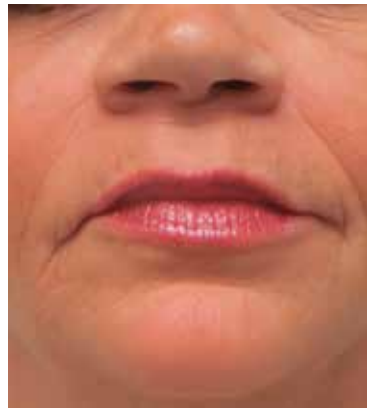
Before and After Lip Filler Injection Plus Botox