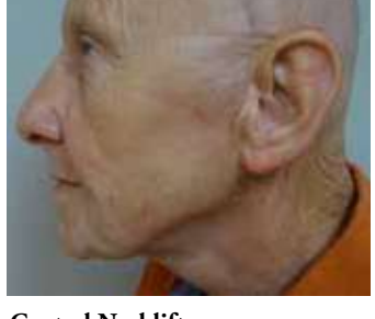
Before and After Central Necklift