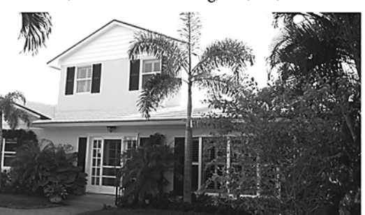
FABULOUS NORTH END CUSTOM HOME: Renovated south exposure 4BR/3BA, 2 master suites, family room, pool with tropical landscaping & deeded beach access. $2,595,000.