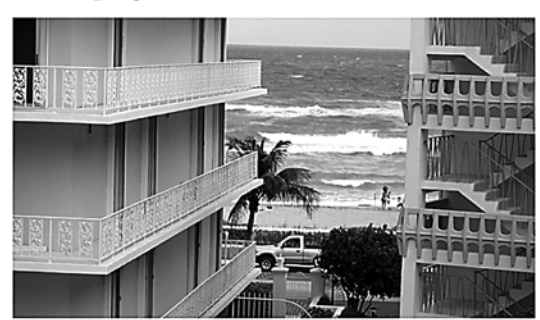
IN-TOWN SOUTH OCEAN BOULEVARD: Custom contemporary 2BR/2BA. High ceilings, top of the line marble kitchen & baths. $995,000.