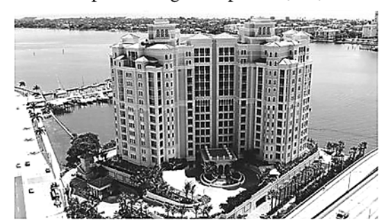
ONE WATERMARK: 4,700 sq. ft. of pure luxury, 3BR, office, family room, custom built-ins, glorious balconies, outstanding views. Pets OK - no weight restriction, Full service building, . $3,898,000.