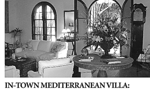
Restored Landmarked Maurice Fatio 3BR/3.5BA + 2BR/2BA guest house w/kitchen, living room. Private tropical setting w/tile pool. $4,495,000.

TRADITIONAL JOHN VOLK: Renovated light and bright 4 bedroom 3.5 bath situated among waterfront estates. Fabulous pool, gardens, and terraces. $3,895,000.